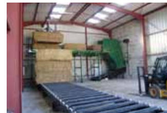
Grass Cutter and Feeding System for cutting and feeding switch grasses, miscanthus, straw, and similar into boilers.

Skanden offers different types of storage bins and feeding mechanisms, to accommodate pellets, wood chips, switch grasses, waste products, and other biomass. We offer a hydraulic live floor fuel discharge systems for wood chips. We have equipment that reliably cuts grasses and straw and feeds it into augers. Our pellet silos can be custom painted to match adjacent architecture.