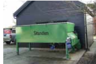
Hydraulically unloaded Storage Systems for wood chips

A Skanden Heating System is not just the most advanced boiler available. It is a total customized solution, comprised of fuel storage and feeding mechanisms, biomass boilers, exhaust system filtration and chimneys.